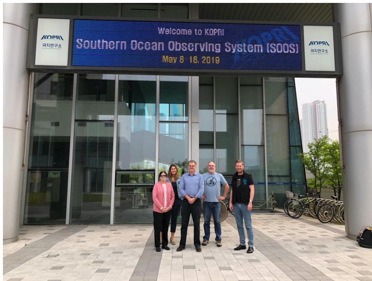
SOOS Executive Committee at KOPRI

The minutes from the SSC meeting are available on the SOOS website ( soos.aq/about-us/scientific-steering-committee ). SOOS thanks the sponsors and our host KOPRI for the significant organisation and financial support provided in hosting these meetings. SOOS also thanks SCOR and SCAR for their continued support of these annual meetings.